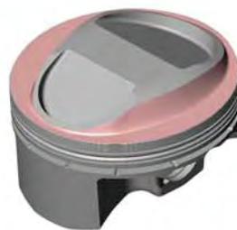
Typical piston with 3D Dome Trace

3-D Dome Trace will scan a mirror image of your combustion chamber onto your piston which will maximize squish and compression.